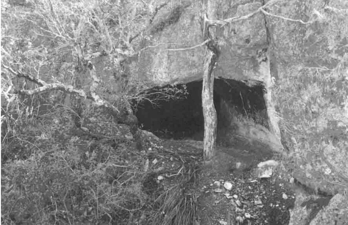
Figure 2. Cave opening, 20 m below the canyon rim and virtually invisible from above.

In an attempt to better describe the variation between these three forms, a sample of 101 projectile points from the Middle Archaic levels of Arenosa shelter (41VV99) were statistically analyzed (Bement 1991). Through the application of discriminant function analysis, it was determined that the three varieties were statistically separable. Two of these groups matched the descriptions of Langtry and Val Verde respectively. The third group was provisionally called Arenosa and described thusly: