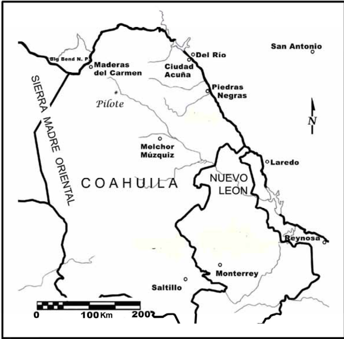
Figure 1. Location map.